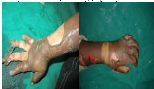
Fig 2. Day 1: Right Hand Burns Left Hand Burns

Case 1: A 4-year female child sustained scald burns due to hot water affecting bilateral hands. They admitted on Day 1 of burn injury with 6% burns. After initial resuscitation, NPWT for the right hand and conventional dressing are given for the left hand. Protocol for NPWT and CD as described following. Edema reduction, discomfort/pain recorded by VAS Scale, Healing in days recorded. (Table 2), ( fig 3-7).