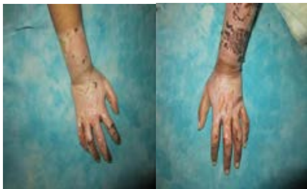
Fig 7. Day 9: Healed Right Hand, Some breach in epithelialization

Case 2 – A 30-year-old lady sustained bilateral hand burns due to spillage of hot milk. She had 3% burns on her right hand and forearm; 3% burns on her left and forearms. The right hand sustained second-degree superficial burns while the left hand and forearm sustained mixed patterns, i.e., second-degree superficial and deep burns. After initial resuscitation, NPWT for the left hand (mix pattern burns) and conventional dressing is given for the right hand. Protocol for NPWT and CD as described following. Edema reduction, discomfort/pain recorded by VAS Scale, Healing in days recorded. Although the left hand sustained mixed pattern burns, its healing due to NPWT application is comparable with the right hand, which had second-degree superficial burns. (Table 2), (Fig 8-11).