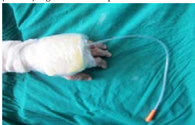
Fig 9. NPWT Application to left hand