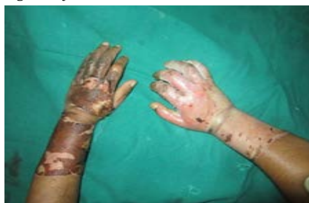
Fig 5. Day 5: Edema reduction