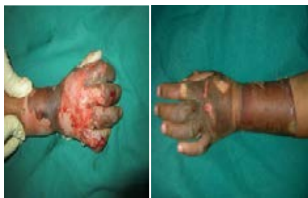
Fig 4. Day 3 status