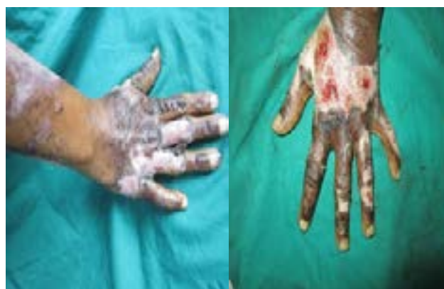
Fig 11. Day 7: Near total epithelialization in NPWT HAND