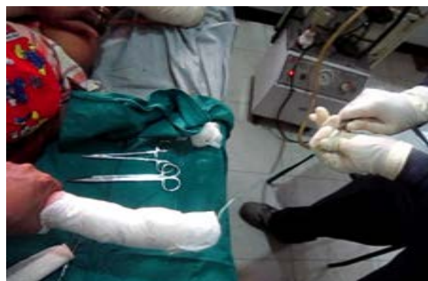
Fig 3. NPWT Application to Right hand