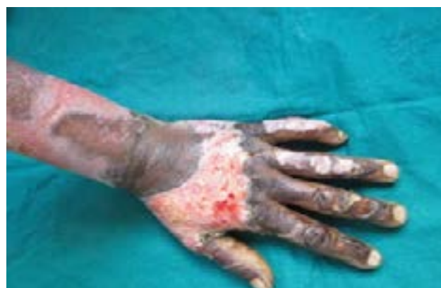
Fig 10. Day 5: Significant reduction in edema in NPWT hand.