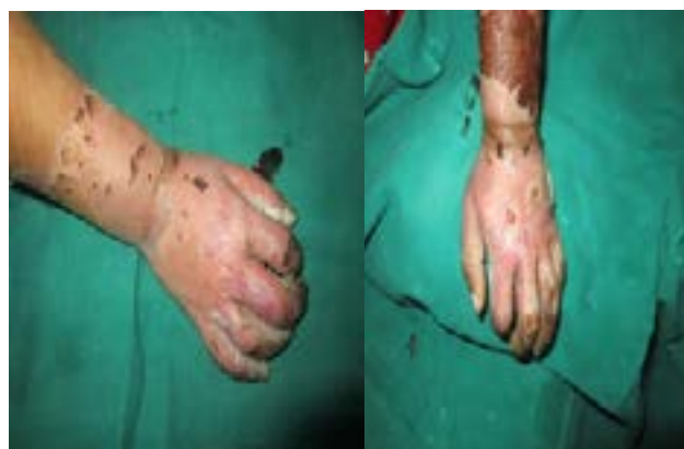
Fig 6. Day 7: Complete Epithelialization in NPWT