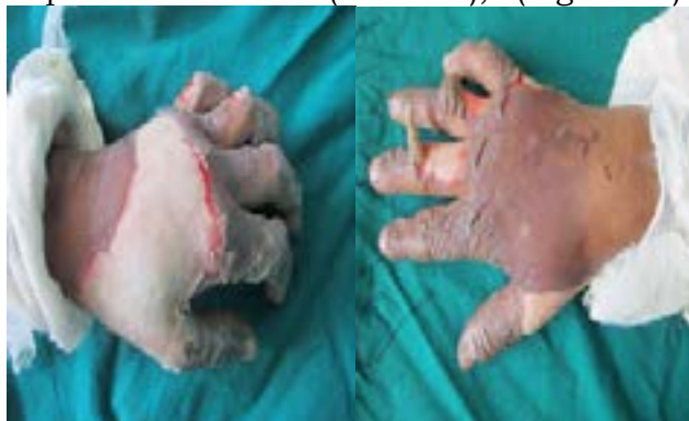
Fig 8. Day1: Left hand Mixed pattern burns (SS+SD) Right hand 20 superficial burns.

Case 2 – A 30-year-old lady sustained bilateral hand burns due to spillage of hot milk. She had 3% burns on her right hand and forearm; 3% burns on her left and forearms. The right hand sustained second-degree superficial burns while the left hand and forearm sustained mixed patterns, i.e., second-degree superficial and deep burns. After initial resuscitation, NPWT for the left hand (mix pattern burns) and conventional dressing is given for the right hand. Protocol for NPWT and CD as described following. Edema reduction, discomfort/pain recorded by VAS Scale, Healing in days recorded. Although the left hand sustained mixed pattern burns, its healing due to NPWT application is comparable with the right hand, which had second-degree superficial burns. (Table 2), (Fig 8-11).