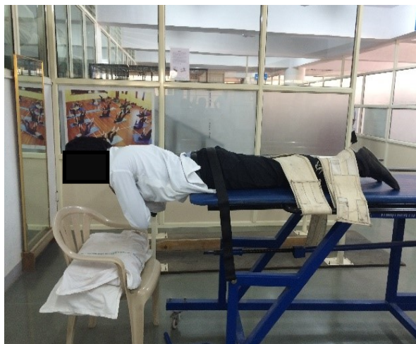
Figure 1. Showing Sorensen's test

For trunk flexor endurance test, the participants were initially instructed to lay in supine lying with hip and knee 90° flexion. They were then instructed to curl their arms around the chest and flex their trunk to 60°. Also, toes were secured using under toe strap or by