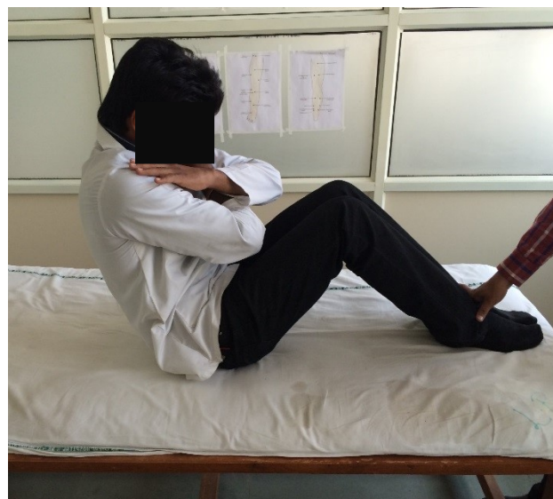
Figure 2. Showing trunk flexor endurance test

examiner. Trunk flexor endurance test is time based test, failure occurs when trunk falls below 60° (Figure 2) [8, 10].